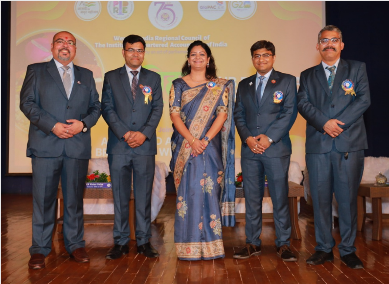
MANAGING COMMITTEE AKOLA 2023-2024